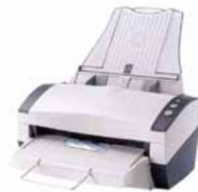
Support plastic cards scanning (front-feed)