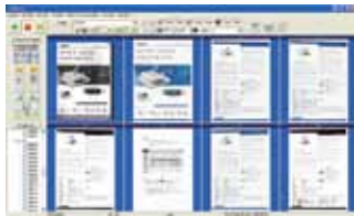
The AvScan 5.0 main screen

-The Intelligent Document Management Tool