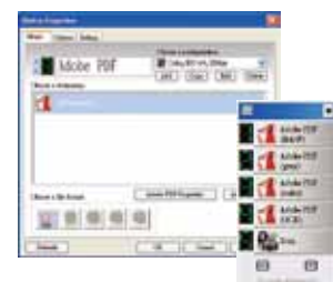
The Button Manager main screen