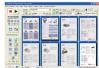
The AVScan main screen

The Avison AV3000 series scanner comes with TWAIN and ISIS drivers and are also bundled with full version of exclusive Avison AV Scan, and ScanSoft PaperPort software application.