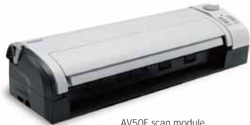
AV50F scan module