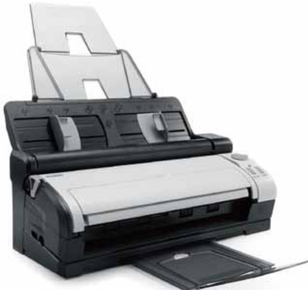
AV50F with ADF