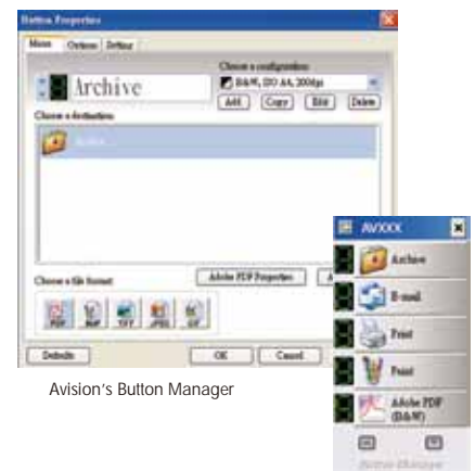
Avision's Button Manager

The Avision AV50F scanner comes with TWAIN and ISIS drivers and is also bundled with full version of exclusive Avision Button Manager, ScanSoft PaperPort, Avision ScanPortfolio, WorldCard.