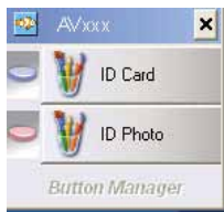
The Button Panel

1. After the Button Manager and the scanner driver have been successfully installed on your computer, the Button Panel will be displayed in the Windows System Tray at the bottom right corner of your computer screen.