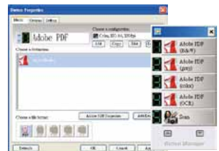
The Button Manager main screen

Avision's state-of-the-art software application, the Button Manager, enables you to complete complex scanning task in just a single step. When the button is pressed, the scanner automatically scans your documents and converts them to a highly compressed file format, Adobe searchable PDF, or other image formats, and then sends the file to a designated folder, or other destination applications such as e-mail, printer, or your favorable software application. The original step-by-step procedure is replaced with only a single touch of the button.