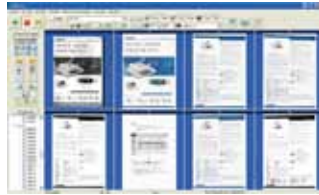
The AvScan 5.0 main screen

Document Imaging is the very first step of Document Management. However, poor quality images can cause serious problems to later indexing or storing processes. It may increase scanning labour costs and lowers the OCR accuracy. AvScan 5.0 ensures all documents are checked and polished at the time they are scanned such that the image quality is guaranteed before they are ready to use for other purposes.